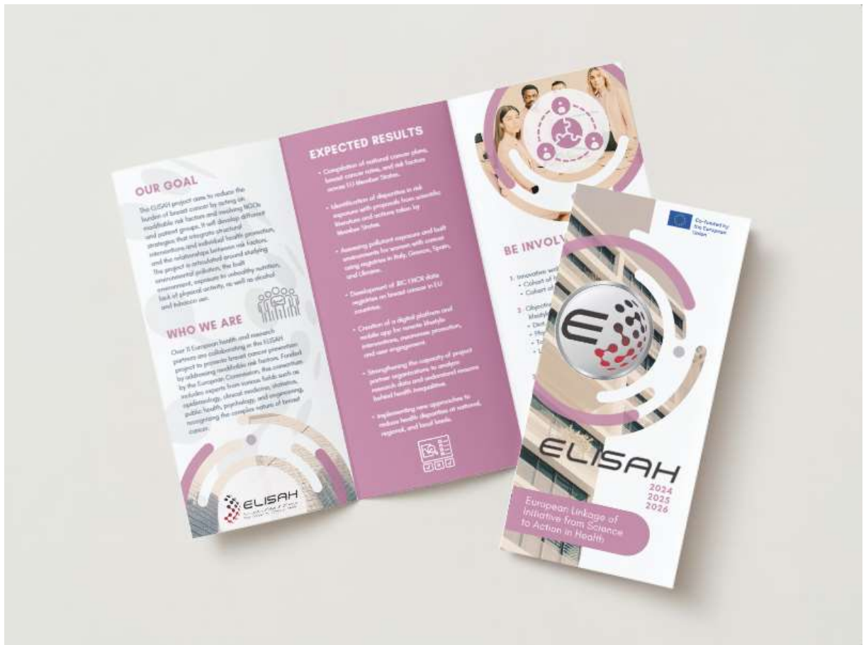
Figure 8. ELISAH leaflet