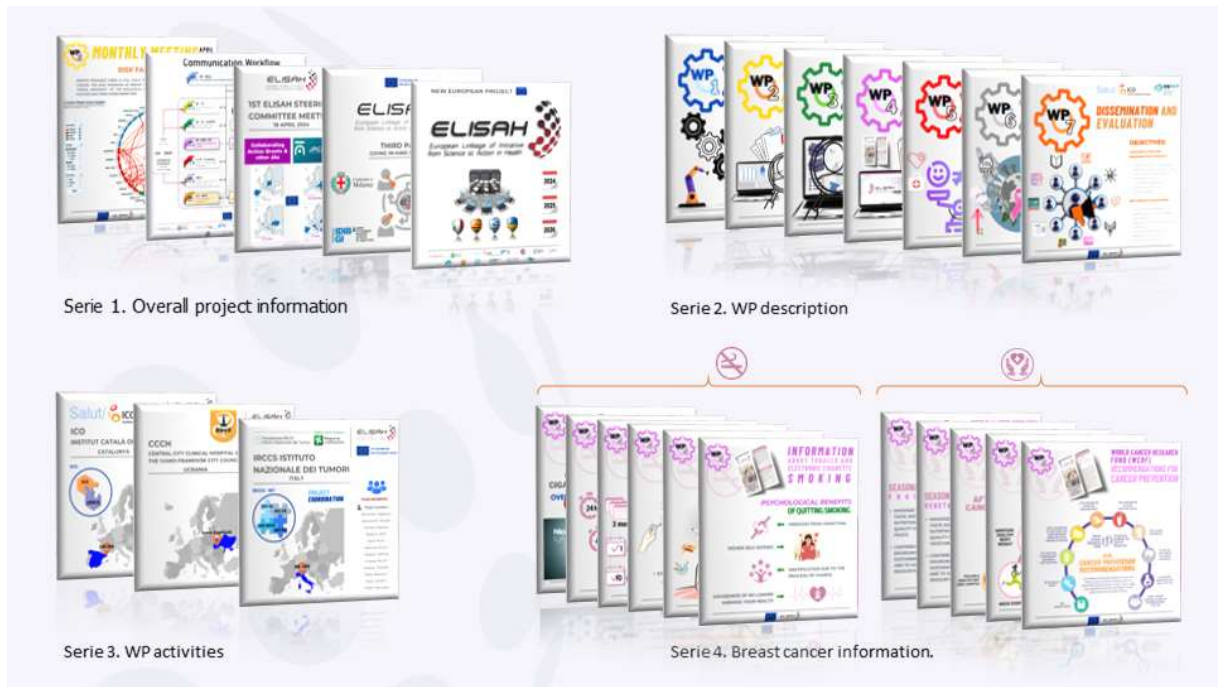
Figure 6. Sample of the different series