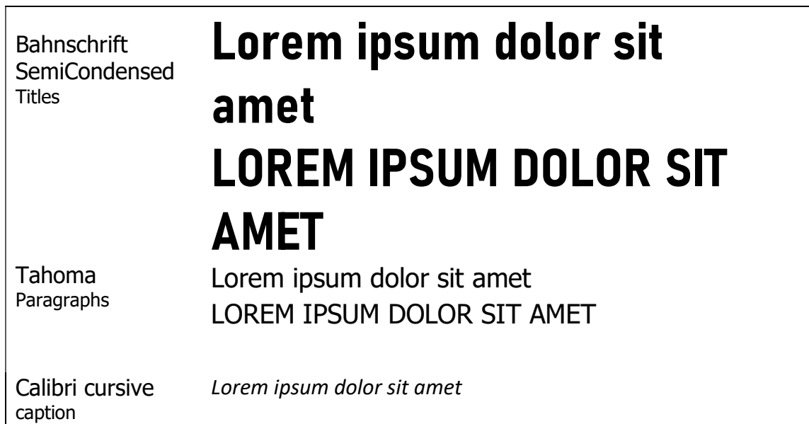
Figure 3: ELISAH fonts

Bahnschrift is a modern sans-serif font developed by Microsoft. It is designed to be legible on both screens and in print. Here are some typical features of the Bahnschrift font: