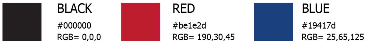
Figure 2: ELISAH HTML color codes

The colors chosen for the visual identity are dark blue (#173e7d), red (#be1e2d) and black (#000000) (Figure 2, Annex 2).