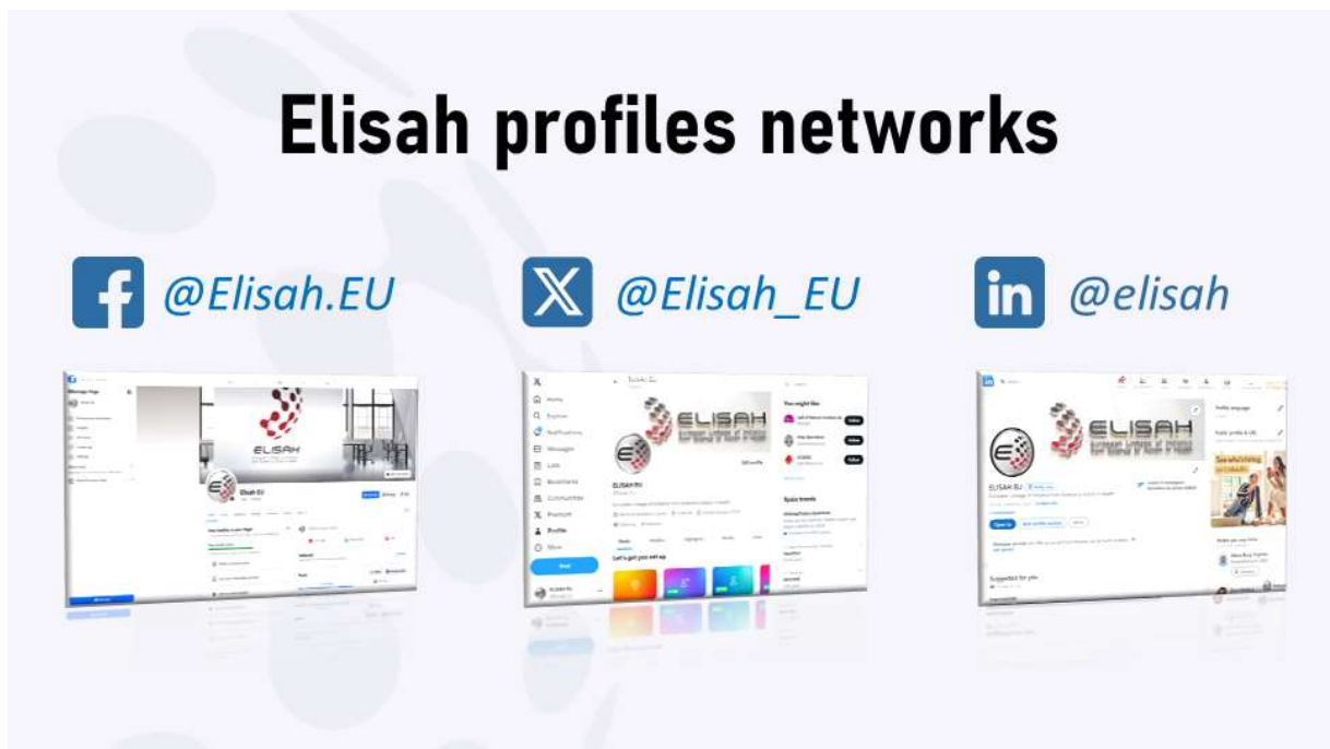
Figure 7. Social media profiles