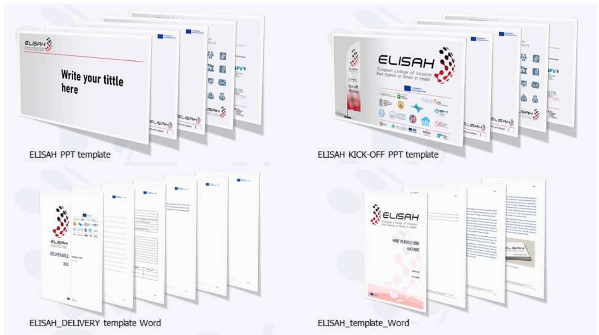
Figure 4. Captures of templates

Finally, in terms of visual identity, colors have also been defined to identify each of the WPs of the project. These colors are shown in Figure 5.